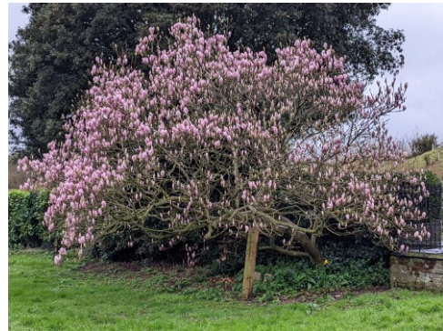
Magnolia Tree at Gore Cemetery

In the churchyard work has taken place recently on 4 cherry trees and there have been a few small repairs to the wall paid for by Arreton Parish Council. The magnolia tree in Gore Cemetery is looking splendid at the moment and maintenance work has also started on the shed.